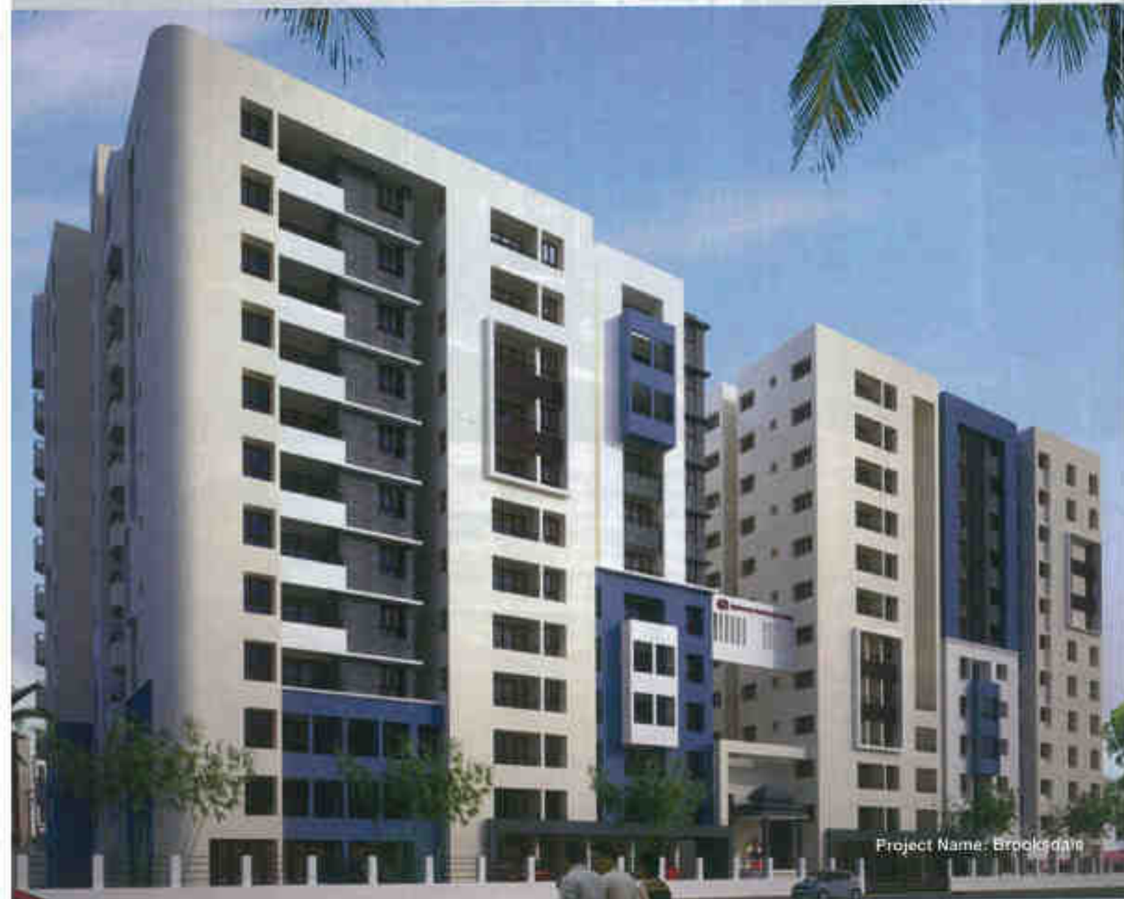
Project Name: Brookdale