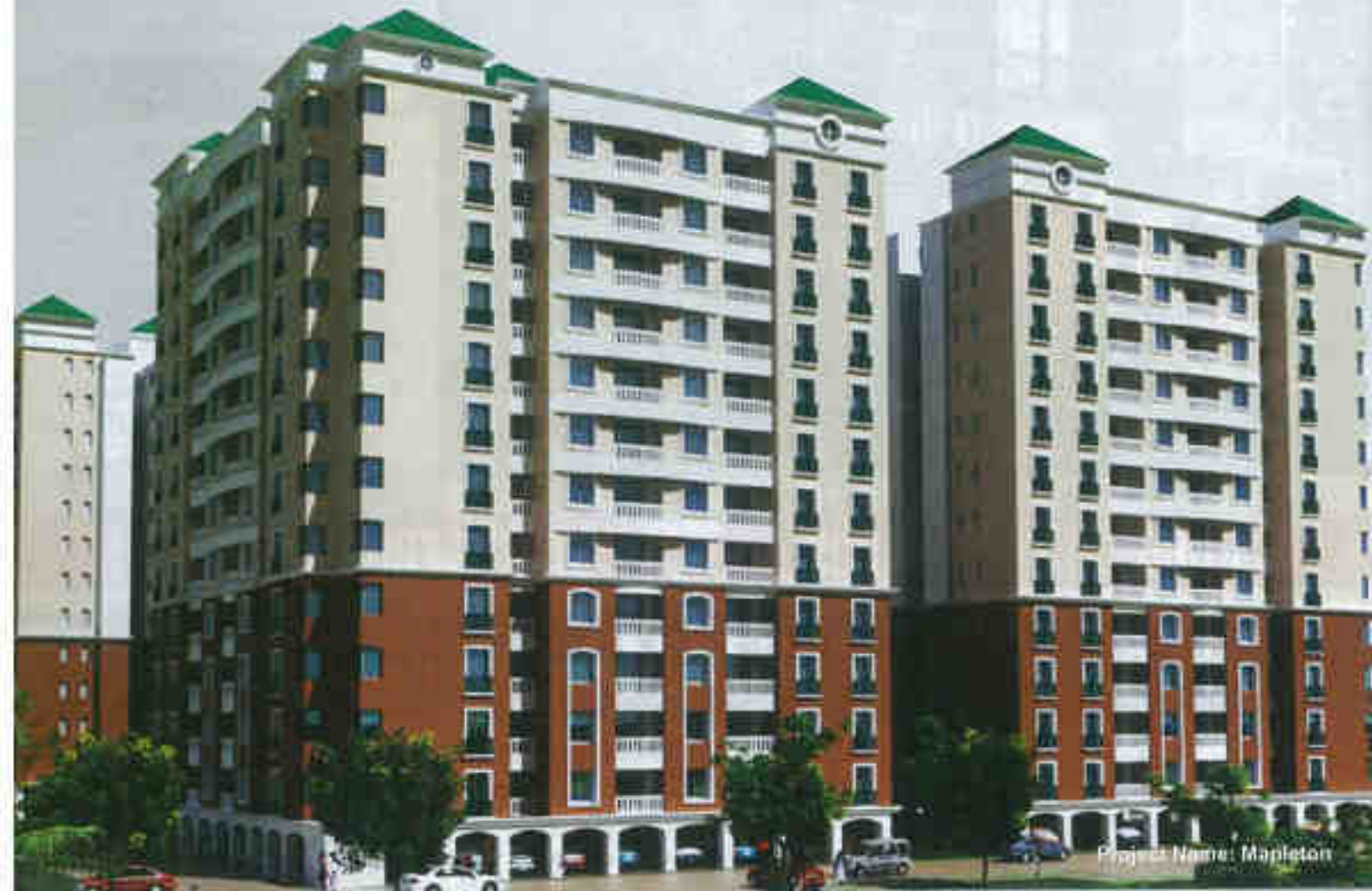
Project Name: Mapleton

SI Constructions and Rama. We have done a lot of work since then, developing property around 10 million sqft, and continue to have ongoing and planned projects for about another 7 million sqft. Our projects include residential, commercial and hospitality. However, our focus is on residential projects, and we are among the top players in the city. We have also developed properties