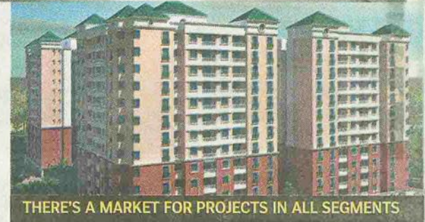
THERE'S A MARKET FOR PROJECTS IN ALL SEGMENTS