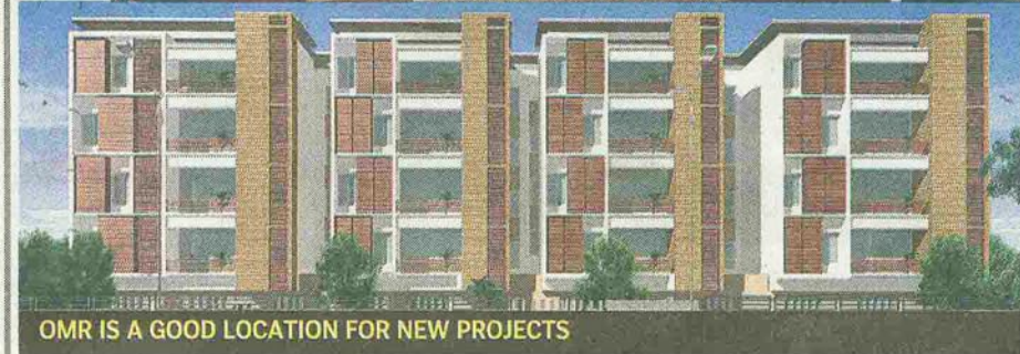
OMR IS A GOOD LOCATION FOR NEW PROJECTS